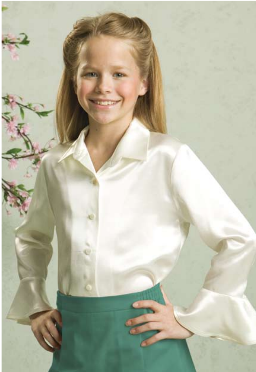
Girls' blouses have collar and stand in one. View A has decorative front and back yokes, front tabs, snap closure, pockets with flaps, and full-length sleeves with cuffs. View B has front tab, button closure, short sleeves, and one pocket. View C has fold-back facings, button closure, and three-quarter length sleeves with flounces.