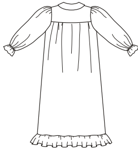
VIEW A Back